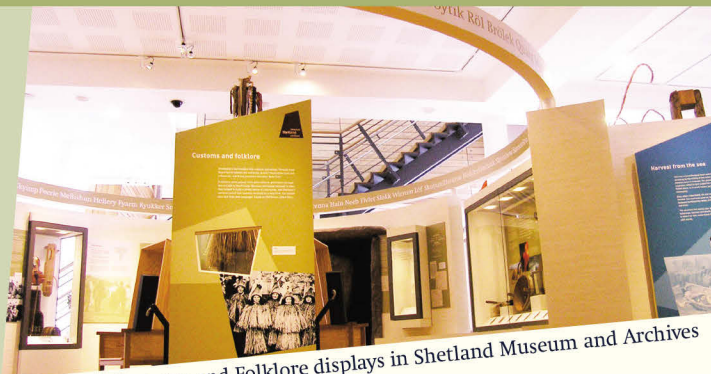
Customs and Folklore displays in Shetland Museum and Archives

The Shetland Museum and Archives, situated on the restored Hay's Dock in Lerwick, is the best place to set out on your voyage of discovery to learn about Shetland's three billion year old history. Here you will discover the story of Shetland from its fiery birth, describing the influence of its inhabitants on the landscape, their lifestyle, technology, architecture, art, folklore and music. The new facility also incorporates Shetland Archives with excellent research facilities to explore the large collection of written, photographic and oral archives.