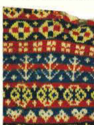
Fair Isle knitwear

The Bød of Gremista, is home to the Shetland Textile Working Museum which gives a fascinating insight into the world of knitting, spinning and weaving which is such an important part of Shetland's heritage.