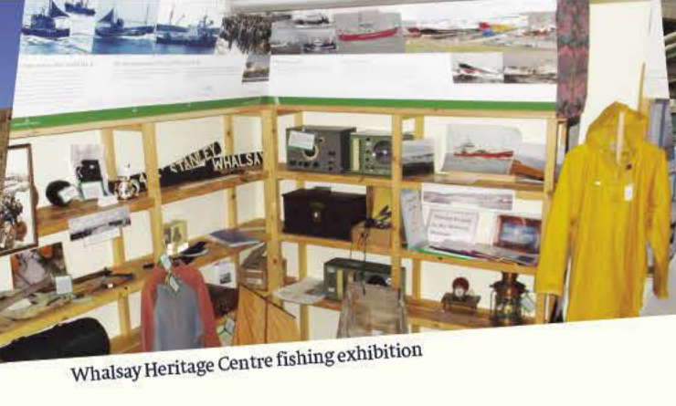
Whalsay Heritage Centre fishing exhibition