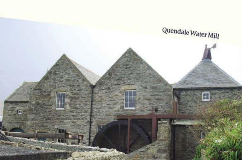
Quendale Water Mill

from the wreck of the Lessing in 1867 the scene of a daring and successful rescue.