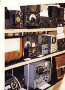
Tune in to your favourite station at Hoswick Visitor Centre

Another centre worth a visit is the Hoswick Visitor Centre where as well as learning about the local area, you can see part of a large collection of radios owned by a local collector. Staying in Sandwick the Sandsayre boats sheds include historical, cultural and environmental displays.