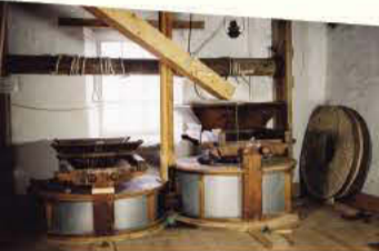
Quendale Water Mill

While at the South end of Shetland, why not compare the mill at the Crofthouse Museum with the Quendale Water Mill. The mill was built in 1867 to handle the grain from the Quendale Estate, but it also ground grain for crofters from a very wide surrounding area. A 10 minute video of the mill in full working order can be viewed at the mill visitor centre. Imagine the smell and dust when the mill was working at full capacity.