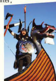
The Up Helly Aa exhibition celebrates the great annual fire festival

However if its burning boats you are after, then you must visit the Up Helly Aa Exhibition in Lerwick and see the full size replica of the galley which is burnt every year.