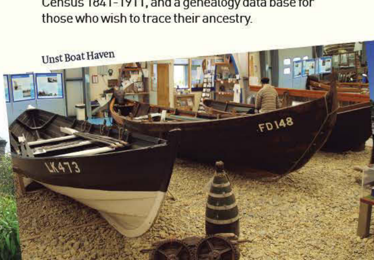
Unst Boat Haven