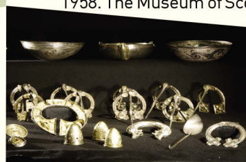
Replicas of St Ninian's Isle Pictish treasure

The most famous Shetland treasure is the St Ninian's Isle Pictish treasure, discovered during excavations in 1958. The Museum of Scotland in Edinburgh displays the originals, but high quality replicas can be seen in the Shetland Museum and Archives along with carved pillar stones and other items from the excavation. However, the real treasures of Shetland are to be found in the islands, their people and the collections they care for.