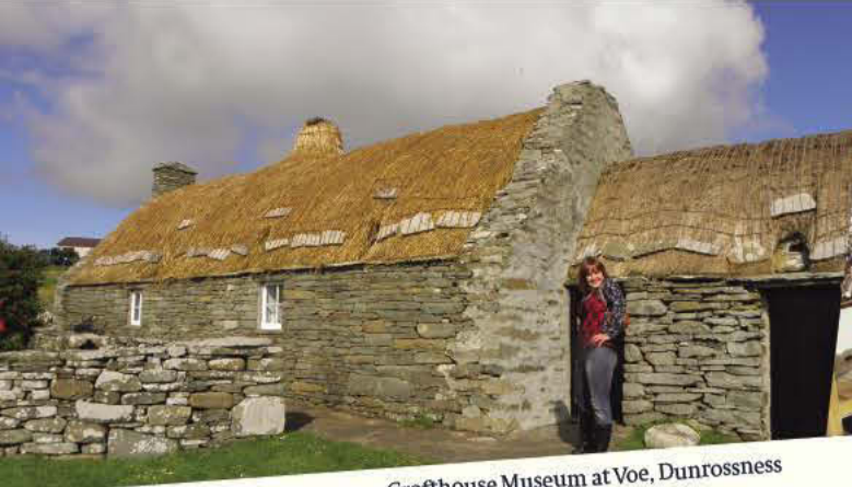
Crofthouse Museum at Voe, Dunrossness