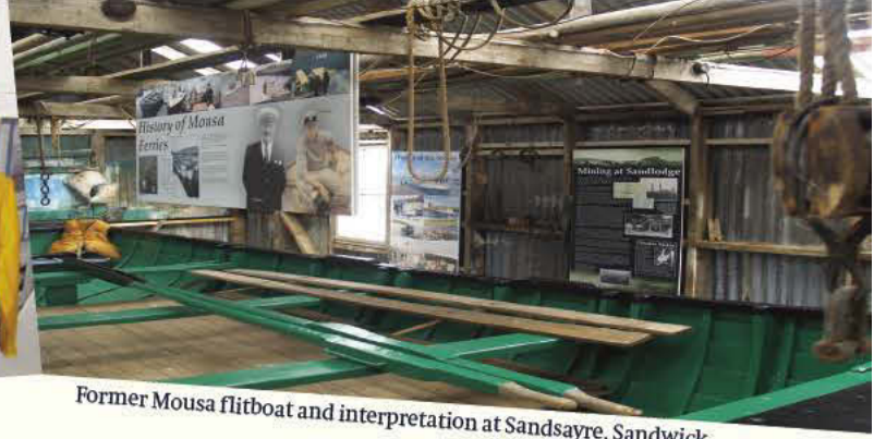
Former Mousa flitboat and interpretation at Sandsayre, Sandwick

You get a great feeling for early life in a Shetland crofthouse at the Crofthouse Museum, Dunrossness. This restored thatched crofthouse and watermill are as it would have looked in the 1890's. If the smell of the peat smoke is too much for your nose, then take a sniff of the reest or salt fish, the custodians often dry above the fire. Have a go at setting the moose faa while you are there – a very effective trap!