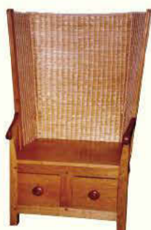
Handmade Fair Isle chair

And so we come full circle on Shetland treasures. There are many treasures to be found but perhaps the best treasures are in the people themselves and the custodians and volunteers who faithfully man the Museums and Heritage Centres throughout the year.