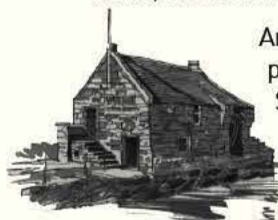
Bremen Bød at Symbister

The museum also houses a vast collection of maritime artefacts from Shetland's long association with the sea. However it is the boats and the stories behind them, which attract most attention.