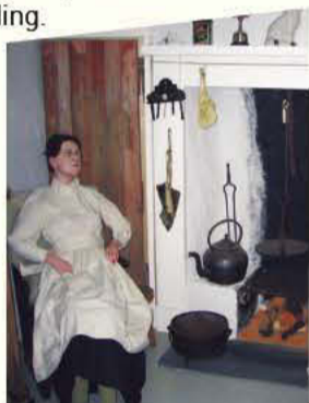
Unst Heritage Centre

Fires and fireplaces are a recurring theme in Shetland Museums and Heritage Centres. Maybe it's because so much of life revolved around the fire, either cooking on it, keeping warm during the long winter days and nights, or the storytelling, which occupied the residents. The most northerly fireplace is to be found in the Unst Heritage Centre at Haroldswick. The Centre is also famous for its fine lace and you don't need to look close to appreciate the delicate work involved. Even more astounding when you consider that the knitter did not have the benefits of modern lighting and it was all created without patterns! Here you can also find out about the exciting Viking Unst project.