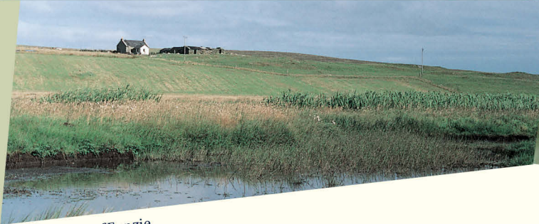
Mires of Funzie

The social life of the island is varied, and visitors are a welcome addition to any local event. Of particular interest are the annual Sheepdog Trials and the Midsummer Foy.