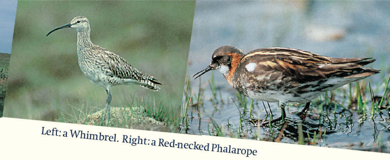
Left: a Whimbrel. Right: a Red-necked Phalarope