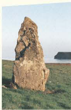
The Stone of the Ripples

More easily accessible is the Giant's Grave, just off the road to Aith. It is the site of a Viking boat burial which was the subject of excavations by the television programme Time Team in 2002, along with a Norse house site at Gord. The sites were covered over after the excavations, but information on the digs can be found at Fetlar Interpretive Centre.