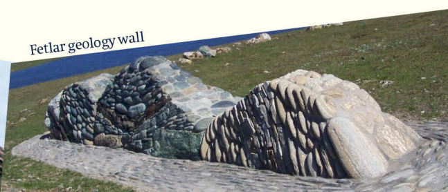
Fetlar geology wall