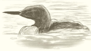
A Red-throated Diver