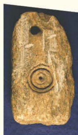
Norse soapstone loom or fishing weight found at Gord

The Interpretive Centre is also a Neighbourhood Information Point.