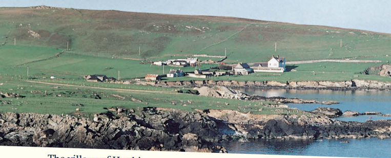
The village of Houbie