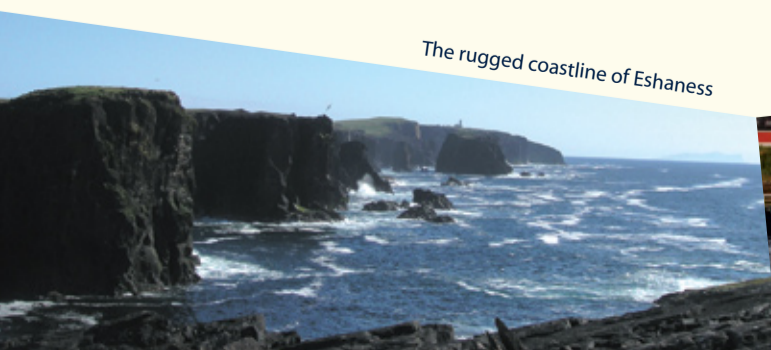
The rugged coastline of Eshaness

The geography also makes Shetland ideal for summer sailing: there are dozens of sheltered, natural harbours - many now boasting good piers, slipways and marinas; most of the coast is "steep-to", with deep water close to shore and nearly all dangers clearly visible if there's a swell running; the coast is well-charted and visiting yachts have the reassurance that local search and rescue services are first-class.