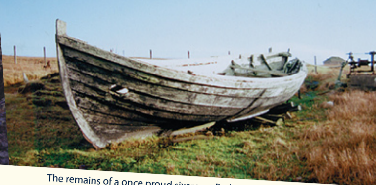
The remains of a once proud sixareen, Fetlar