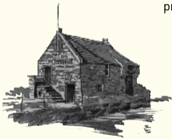
The Bremen Böd at Symbister, Whalsay

provide a fascinating insight into the development of maritime trade and the fishing industry in Shetland.