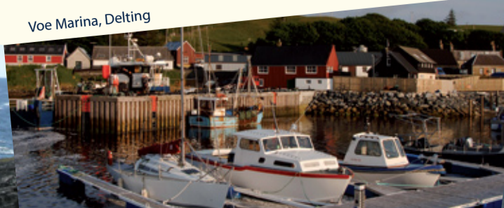
Voe Marina, Delting

From the battlements of Fort Charlotte there's a grand view over the harbour and Bressay Sound. There's always something to watch on the Lerwick waterfront. Unlike many harbours these days, most of it is accessible to pedestrians. The coming and goings of ships and seafarers are a constant source of interest, particularly around the Small Boat Harbour, with its visiting yachts, local small craft and Lerwick's new Severn-class RNLi lifeboat, and oot ower at Morrison Dock, where the inshore fishing fleet is based.