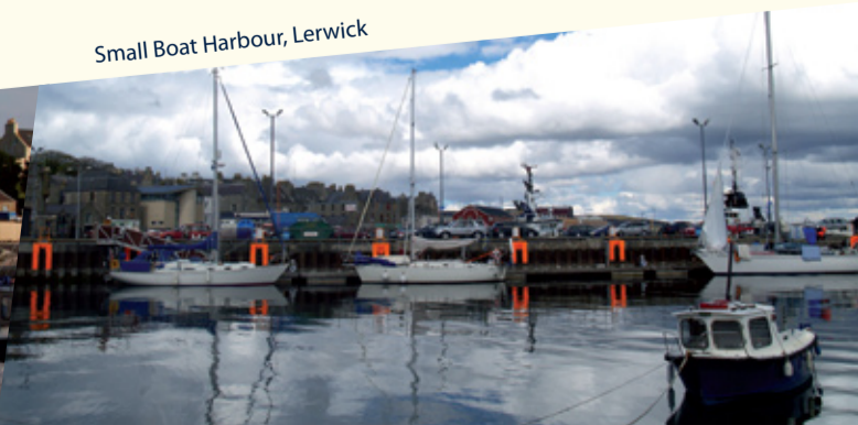
Small Boat Harbour, Lerwick