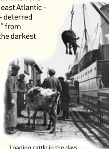
Loading cattle in the days before roll-on/roll-off ferries

Throughout Shetland our museums and visitor centres provide fascinating insights into the islands’ maritime heritage, from the tiny museum on Fair Isle to the main Shetland Museum and Archives in Lerwick with its exquisite ship models. The Unst Boat Haven in Haroldswick is a must for anyone with an interest in traditional fishing craft; in Yell the Old Haa of Burravoe has a fine collection of sailors’ gear and marine artwork; and the Scalloway Museum displays the courageous and heart-warming story of the wartime “Shetland Bus” operation to Nazi-occupied Norway. Other centres well worth a visit include the Bressay Heritage Centre, Tangwick Haa in Northmavine and the Fetlar Interpretive Centre.