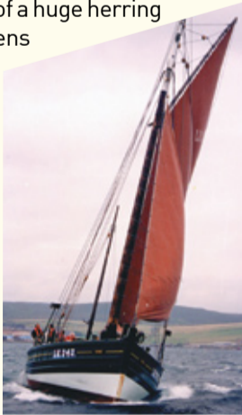
Restored drifter the Swan

In the first decade of the 20th century Lerwick and Baltasound were the centres of a huge herring fishery by steam drifters. Dozens of smaller ports around the Shetland coast had their own curing stations, attracting tens of thousands of migrant workers every summer. The First World War destroyed the Russian and East European markets but gutters, packers and coopers lasted into the 1960s, when drifters became obsolete and were replaced by purse-seiners and, in the 1990s, by pelagic trawlers.