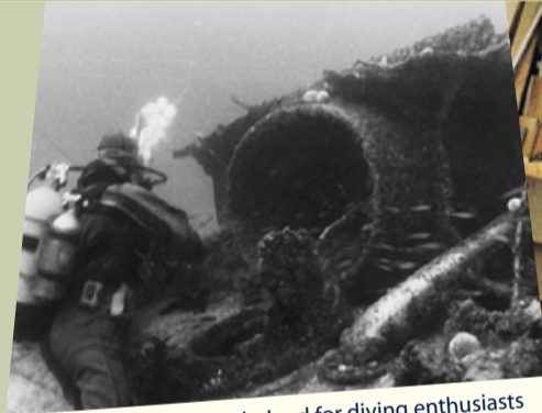
A wonderland for diving enthusiasts