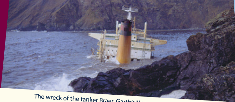
The wreck of the tanker Braer, Garth's Ness

Garthspool (1815) and Hay’s Dock (1820) were the first harbours in Shetland where ships could lie alongside to work cargo.