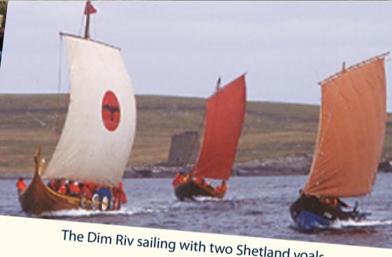
The Dim Riv sailing with two Shetland yachts