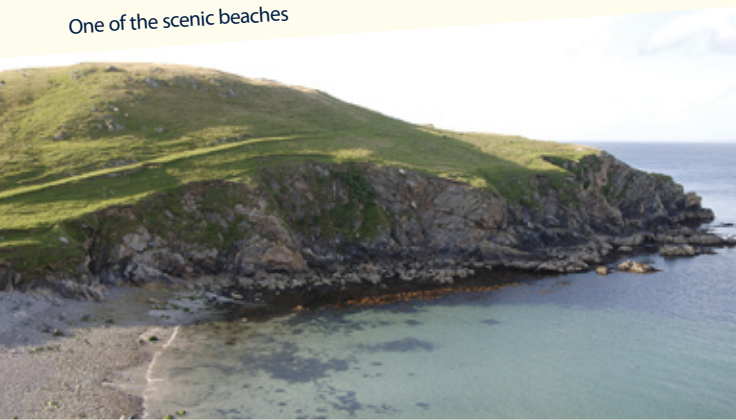
One of the scenic beaches