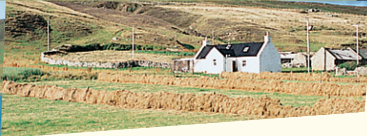
A croft at the Dale o Waas

This is a classic “drowned coastline”, flooded by the sea at the end of the Ice Age, some 12,000 years ago. The shorescape varies from the dramatic cliffs of the outer coast to long voes (sea inlets), which extend far into the heathery hills and green croftland. Whatever the wind direction, you can always find a sheltered beach.