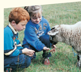
Walls and District Agricultural Show held during August

A network of well-maintained side roads leads the visitor to dozens of quiet corners and some of the most beautiful and peaceful landscapes anywhere. Every bend of the road reveals new facets of an ancient landscape which has been inhabited for at least 5,000 years. Two to three thousand years ago the climate was much warmer and drier. Crops could grow on what is now barren moorland. Traces of ancient farmsteads and field systems are everywhere. Excavated habitation sites at the Scord of Brouster and Stanydale date from this period and show that crops could grow on what is now barren moorland. The Westside also has several ruined brochs – fortified circular stone towers dating from around the time of Christ.