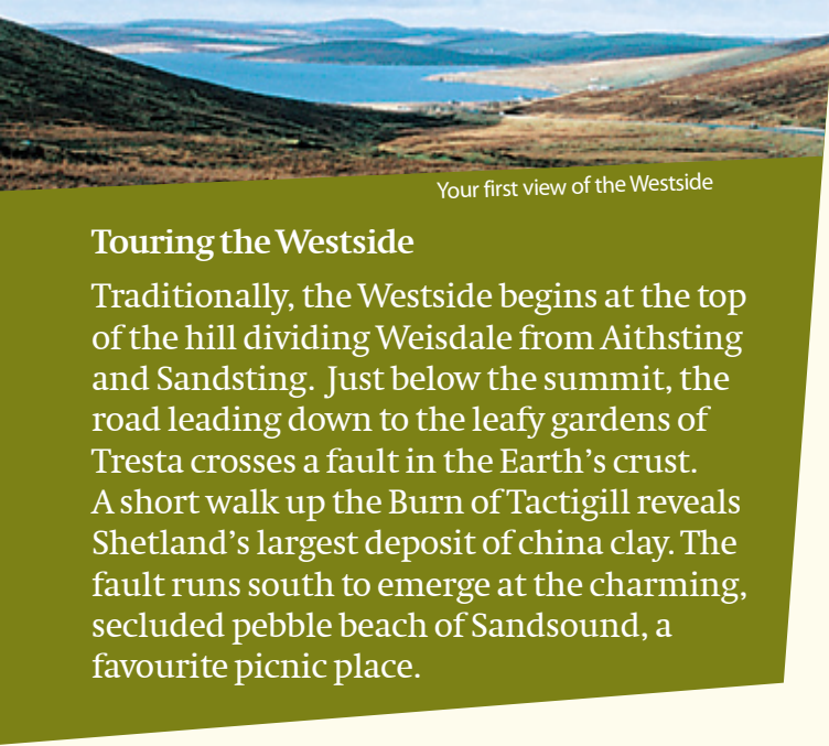
Your first view of the Westside