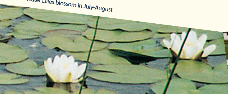
Water Lilies blossom in July-August

There are hundreds of freshwater lochs, most of them in hollows carved by glaciers out of the granite and sandstone rocks. The lochs and the burns linking them to the sea are home to trout, ducks, wading birds and plants such as Bogbean and white Water Lily.