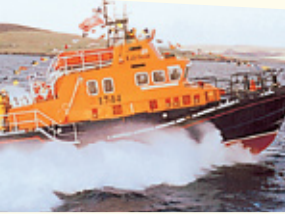
The Aith lifeboat services Shetland’s western coastline

Galtafirth is one of Shetland’s most sheltered voes and a winter favourite with birdwatchers – particularly for sea ducks, divers, grebes and waders. Seals often haul out along the shoreline of Bixter and Effirth Voes. The village of Bixter has a shop and a children’s play park nearby. Here the road branches north to Aith – a large township in a scenic setting. Aith has a shop, leisure centre, the Westside’s secondary school, a charity shop and a fine marina.