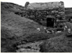
One of the Huxter watermills

Sandness Hill and the coastal walk beyond Huxter have breathtaking views of the westernmost point of the Shetland mainland. The dramatic silhouette of the island of Foula sits out on the Atlantic horizon, while a maze of spectacular coves and sea stacks skirts the beautiful Bay of Deepdale. There is more good walking south to Watsness, Footabrough and Littlure.