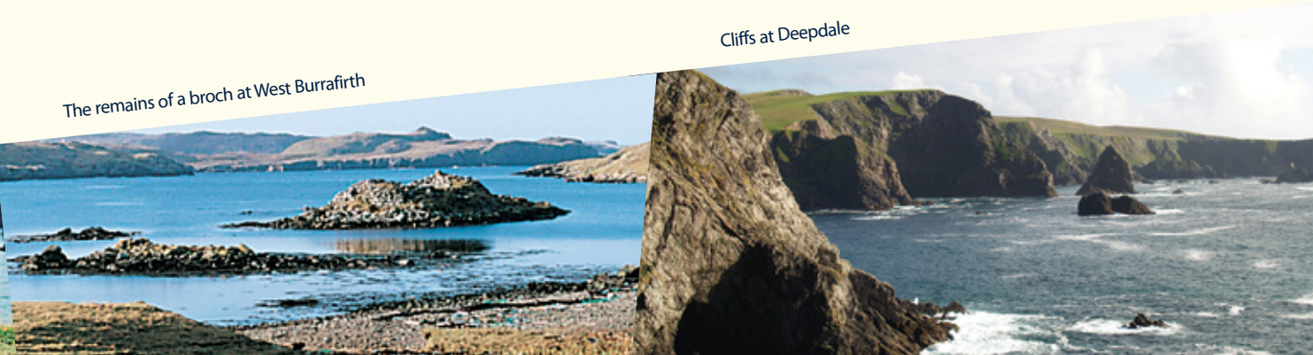
The remains of a broch at West Burrafirth