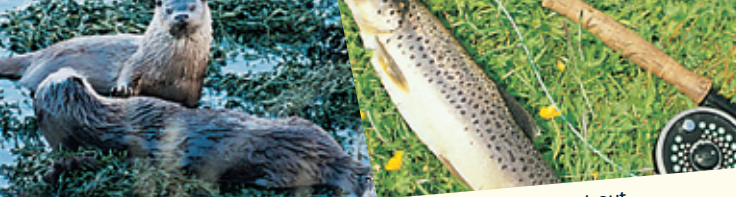
Otters are plentiful but shy