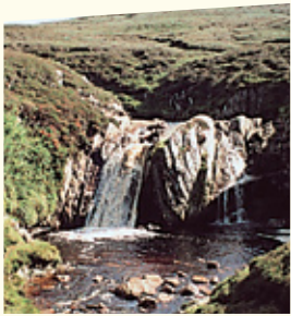
The waterfall at Lunklet

One of Britain’s most modern RNLI lifeboats, a 17-metre, long-range, ‘Severn’ class boat, is stationed at the Aith Pier. Take time to stop at Michaelswood, a small woodland with a picnic area, wildlife pond and bird hide. Just north of Aith is the hamlet of East Burrafirth, where a path leads up the Burn of Lunklet to the waterfall and on to some exhilarating hill-walking with wonderful views of the Westside’s lochs, hills, islands and voes.