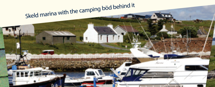
Skeld marina with the camping böd behind it