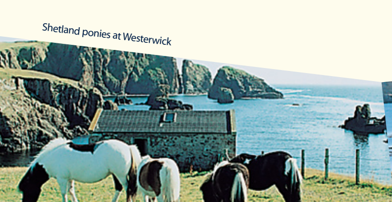
Shetland ponies at Westerwick

The village of Waas (Walls) makes a good base for exploring the Westside, with its camping böd and bed-and-breakfast houses. Sheltered by its islands, Vaila Sound offers safe summer anchorages and a ferry service to the island of Foula. There is also a bakery, shop (with Neighbourhood Information Point), post office and a cheerful boating club which welcomes visitors. Just above the shop you will find the Baker’s Rest tearooms where you can enjoy goods direct from the Walls Bakery.