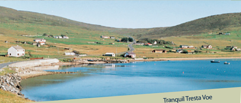
Tranquil Tresta Voe