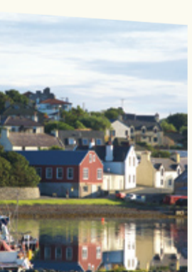
The West end of Main Street with Norway House in the foreground