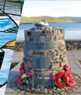
The memorial to those who died serving in the "Shetland Bus"