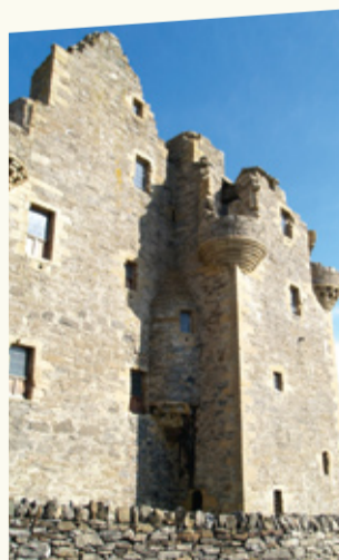
The stark ruins of Scalloway Castle dominate the seaward approaches to the village

Overlooking the fine new harbour is Earl Patrick Stewart's Scalloway Castle, built by forced labour in 1599. It was carefully positioned to control the safe anchorage and the fertile farmlands to the north. The castle is a grand example of a Scottish fortified house. But it was occupied for less than a century, and is now roofless. Beneath the grand banqueting hall are large kitchens and a guard-room where 17th century witches, condemned to hang on nearby Gallows Hill, waited to hear their fate. The castle is under the care of Historic Scotland and is open to the public.