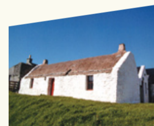
Restored croft house at Duncansclate, Burra

Two of the original stones and a replica of the Papil stone are on show at the Shetland Museum and Archives in Lerwick.