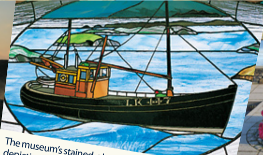
The museum's stained-glass window depicting the fishing industry