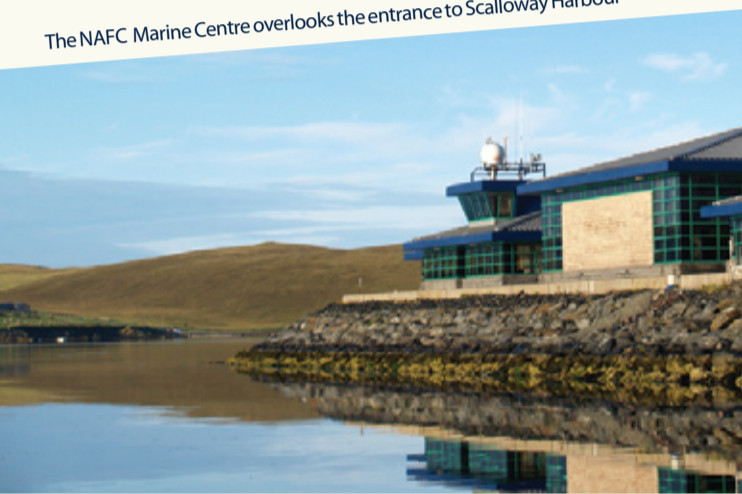
The NAFC Marine Centre overlooks the entrance to Scalloway Harbour

Throughout the village are a number of works of public art including sculptures done in Hildasay granite and flower tubs recycled from tractor wheels and tyres.