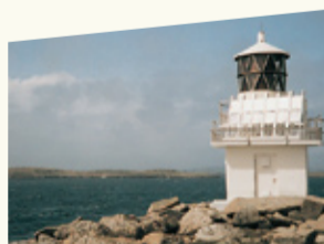
The Fuglaness light marks the entrance to Hamnavoe harbour and the southern approach to the port of Scalloway

Meal Beach is one of Shetland's finest beaches and a favourite picnic spot (with convenient car park).