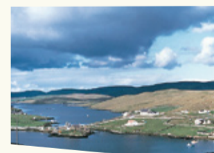
The bridge between East and West Burra

Beyond the hamlet of Houss lies Houss Ness, a promontory with more good walking, rock scenery, seabirds and seals. And, wherever you walk or drive in Burra, there's always that mysterious and dramatic silhouette of the isle of Foula, out on the Atlantic horizon.