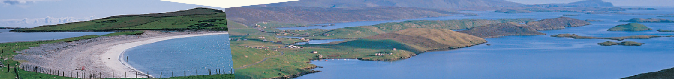
Weisdale Voe and the south-west coast of Shetland – viewed from the Scord of Weisdale