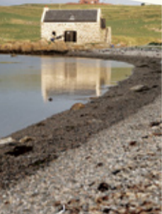
Böd of Nesbister

Past the Lawting Holm and the Tingwall Kirk, near the junction with the main A971 road to the west, there is a pub restaurant, and the Tingwall Public Hall, noted for its Sunday teas and social functions.