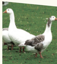
Domestic Shetland geese have differing male and female plumage

At Burland on Trondra the Shetland Croft Trail is a wonderful place for children to see old Shetland breeds of livestock, and to learn about crofting history and traditional crafts such as boatbuilding. The Burra Bridge leads to the pretty fishing village of Hamnavoe, with lovely coastal walking out to the lighthouse on Fuglaness.