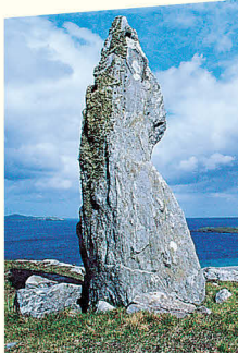
Standing stone at Skellister

Over the hill, the hamlet of Billister is another favoured spot for sea trout. A walk along the coast to the east brings you to the granite quarry used to build the laird's mansion at Symbister on Whalsay. The road winds north through Grunnafirth and Dury leaving the district of Nesting and entering Lunnasting.