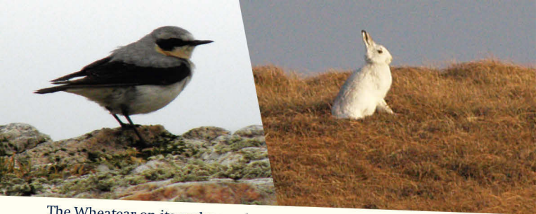
The Wheatear on its rocky perch