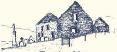
The ruins of the old Olnafirth Kirk

On the north side of Olnafirth, the ruined Olnafirth Kirk is the burial place of the Adies, lairds of Voe and the Gifford lairds of Busta.