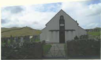
The 18th century kirk at Lunna, with the watchtower on the skyline

Lunna Kirk is the oldest still used in Shetland, built in 1753 on the site of an earlier Mausoleum. Two inscribed slabs from the Hunters of Lunna's Tomb were built into the porch of the church.