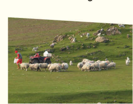
Feeding sheep at Benston

Ten miles north of Lerwick, the 'Nesting Loop' side road (B9075) winds through an intricate landscape of sheltered inlets, scattered crofts and bold headlands.