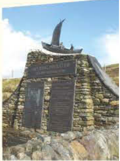
Delting Disaster Memorial at Firth

There is one more side road before Voe - a steep climb over the Easter Hill of Dale brings you to the secluded hamlet of Collafirth and a landscape little changed for hundreds of years - less than five miles, as the crow flies, from the huge tankers and gas flares of the Sullom Voe Terminal.