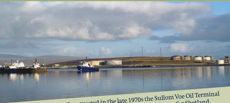
Constructed in the late 1970s the Sullom Voe Oil Terminal heralded an era of prosperity and change for Shetland