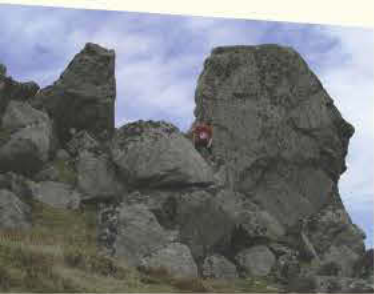
The Stanes of Stofast

Not far away are the the mysterious Stanes of Stofast - a 2,000-tonne 'glacial erratic' boulder split in two by frost. Like the nearby Lunning peninsula, this is a heavily glaciated landscape with eerily-shaped rocks associated with the trows of Shetland folklore.