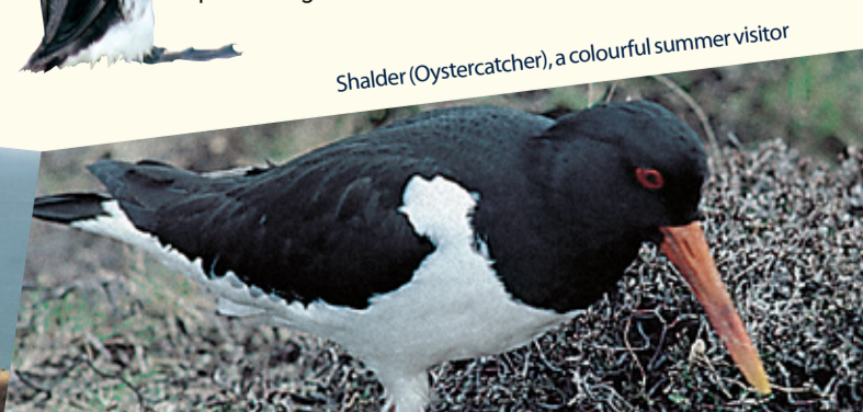
Shalder (Oystercatcher), a colourful summer visitor