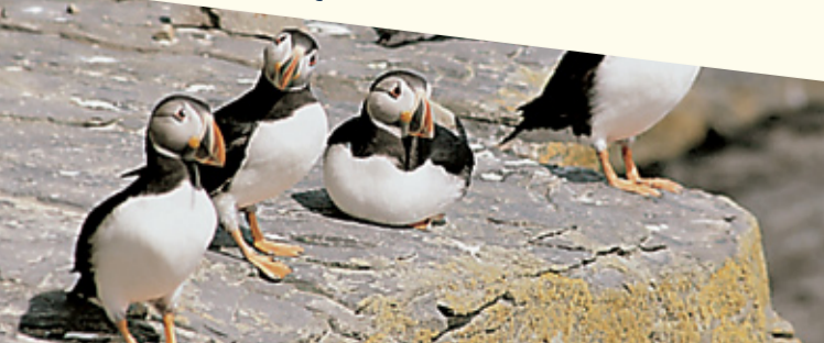
Tammie norries (Puffins) breed in small numbers along the eastern coastline

At Grutwick there is a stone-built cairn erected to commemorate the bravery of the helicopter winchman, William Deacon, who lost his life during the rescue of the crew of the MV Green Lily which foundered here in November 1997. South from Grutwick the spectacular coastline with cliffs, caves and natural arches continues round to the Bressay lighthouse. The walk to the lighthouse is outstanding, but please be careful near the cliff edges, especially in wet weather and in poor visibility. The east side road ends at Noss Sound. On the shore below are the remains of an Iron Age broch, a defensive round stone tower. The prominent building on Anderhill is a World War I lookout.