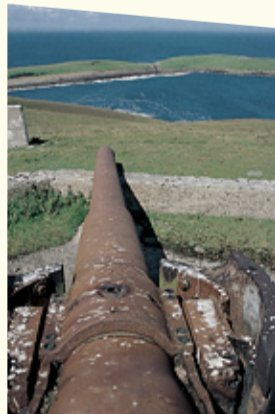
World War 1 gun at Aith Voe

Above Setter a rough track leads towards the headland of Aith Ness, passing the ruins of the old school at Swarthoull and ending at the remote croft of Bruntland. Flooded quarries on Aith Ness are the remains of the 18th and 19th century flagstone industry that provided roofing and paving material for Lerwick. On the top of the hill is an old World War I gun, placed there to protect the approaches to the harbour.