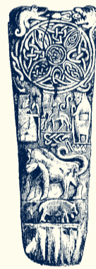
The Bressay Stone

From the Uphouse junction a road leads down to Setter with a rough rutted track continuing to the Voe of Cullingsbrough. A pleasant walk along the shore leads past the old settlement site to a walled churchyard. Within the enclosure are the ruins of the 10th century pre-Reformation chapel of St Mary's. There is also an interpretive board and replica of the Bressay Stone - an engraved Pictish stone which was discovered nearby in 1864. At the north-west corner, the churchyard wall intersects the remains of another broch.