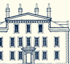
Gardie House - impressive 18th century mansion